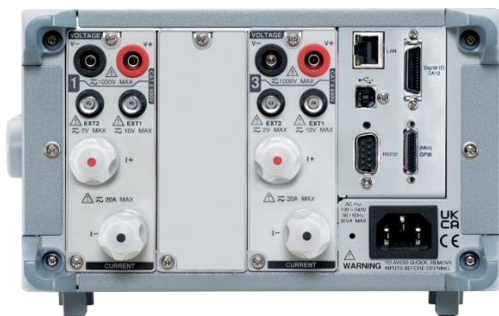
GPM-8320 with opt. GPM-DA12