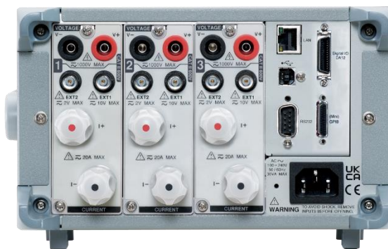
GPM-8330 with opt. GPM-DA12